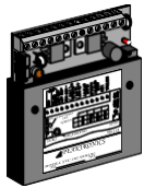
SVC-102 SVC-102A SVC-102B

The SVC Series Solenoid Valve Controllers provide proportional positioning for pneumatic actuators. When AC power is available, these units are ideal for replacing bulky and costly I/P controls. The unit controls two external AC solenoid valves which in turn control the air lines to the open and close ports on the actuator.